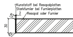
Table top R: 30 mm thick, 28 mm strong multi-layered plywood, surface coated in highpressure laminate (HPL) or veneer according to BRUNE® collection. Lower surface: HPL white or beech veneer. Edges multi-layered plywood, straight edges, 9 mm thick, beveled over 45 mm.

Table top C: 30 mm thick, high-quality multi-layer plywood plate E1, top surface optionally covered with HPL plastic or wood veneer according to the BRUNE® collection. Lower surface white HPL or beech veneer. Straight edge, 2 mm thick, in material to match table top (plastic for plastic, veneer for veneer).