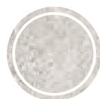
Mactan fossil stone