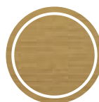
Teak effect aluminum