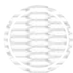
White aluminum mesh

Diameter: 50cm Height: 55cm Weight: 6.5kg Volume: 0.2m 3