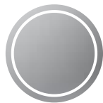
Stainless steel polished

Size: 115 x 45 x 85 cm Weight: 19,5 Kg Volume: 0,50 m3