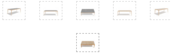
TABLE AND TABLE BASE