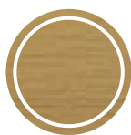
Teak effect aluminum

Dimensions: 96 x 80 x 67.5 cm Weight: 24 Kg Volume: 0.6 m 3 Seat height: 44.5 cm Armrest height: 67.5 cm