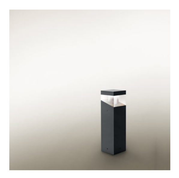
IP 65 (<u></u> ⊕) ((()