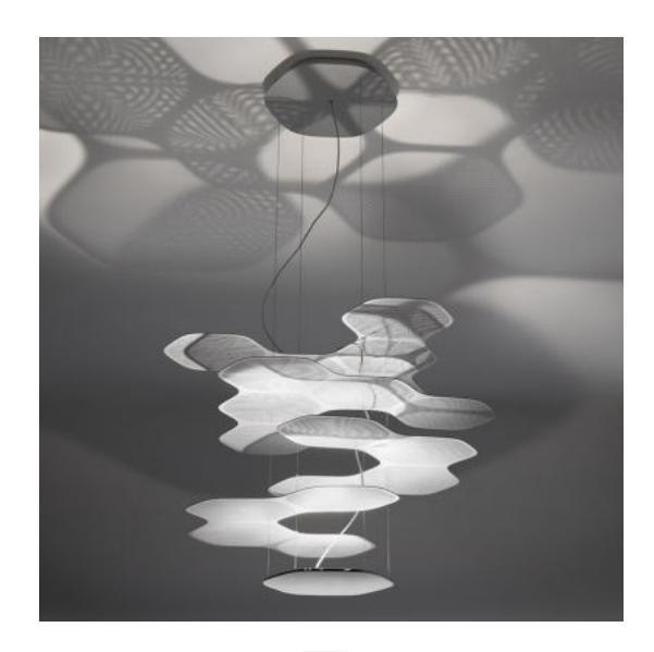
IP20 Dimmerable: +0-