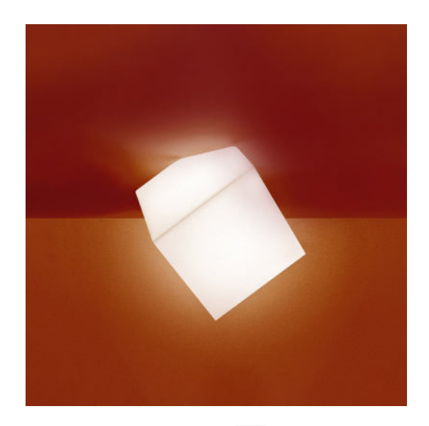
IP 65 ☐ [ | | Dimmerable: + 0 -