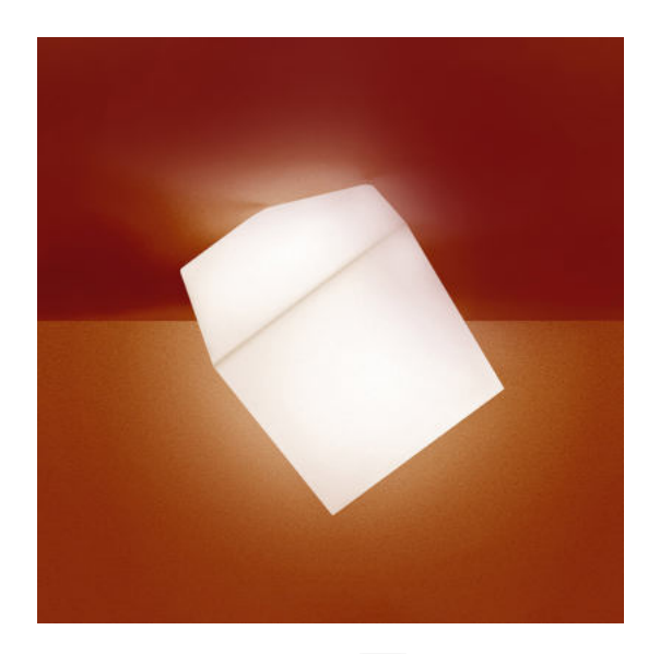
IP 65 ☐ [ | | Dimmerable: + 0 -