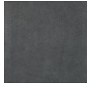
Suede grey 074 Suede grey 074