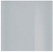
Specchio extralight Extralight mirror