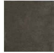
Suede sand 012 Suede sand 012