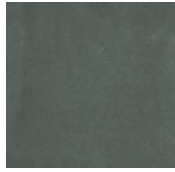
Suede grey 058 Suede grey 058