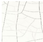
Cristallo Craquelé Craquelé glass