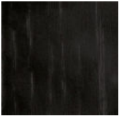
Nero poro aperto (Layer) Black open pore (Layer)