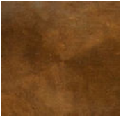
Ottone brunito a mano Hand burnished brass