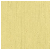
Ottone satinato Satin brass