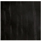
Nero poro aperto (Layer) Black open pore (Layer)