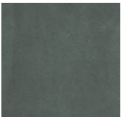
Suede grey 058 Suede grey 058