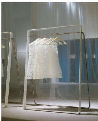
design Duccio Grassi

A practical and elegant clothes hanger which can stand everywhere; it is folding and can be put also in very narrow spaces, in a house, in an office but also in a shop.