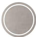
Gres Sugar Glocal gc 07 sp