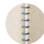
punto cavallo rovescio / reverse blanket stitching