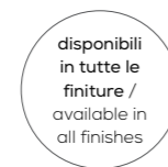
disponibili in tutte le finiture / available in all finishes