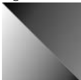
extra clear graphite