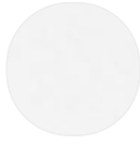
Gloss painted white X060