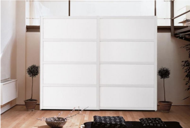
design: Pietro Arosio

Yoshida is a wardrobe which recalls, in its name and in its shape the Japanese culture: its doors look like the sliding panels of Japanese houses. The basic design is given by the frontal frame which holds the panels which are available in different colours.