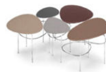
Vaie 5 FG 484.00