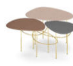
Vaie 3 FG 484.01