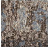
cotton chenille Radja