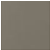
GF30 embossed grey