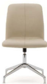
LOTUS COMFORT LOW

Serie di sedute imbottite in poliuretano soffice con rivestimento fisso nei tessuti e pelli di collezione, impunturato con lavorazione selleria. Disponibili nella versione bassa e media, con e senza braccioli, con base a quattro razze in alluminio e puntali in plastica, o con base a cinque razze con o senza ruote e movimento basculante ad altezza variabile. I braccioli sono disponibili anch'essi nella finitura della base. Rivestimento fisso nei tessuti e pelli di collezione.