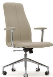
LOTUS COMFORT MEDIUM