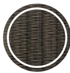
Colonial twisted (08)

Dimensions: 80 x 70 x 120 cm Weight: 20 Kg Volume: 0.75 m 3